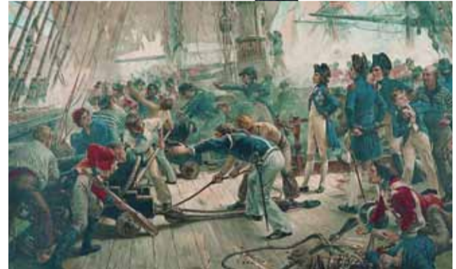
The Hero of Trafalgar, from a painting by/o baentiad gan W H Overend